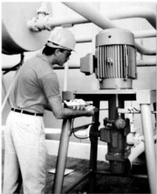
Vertical, magnetic drive 3D-250 pump on chemical service